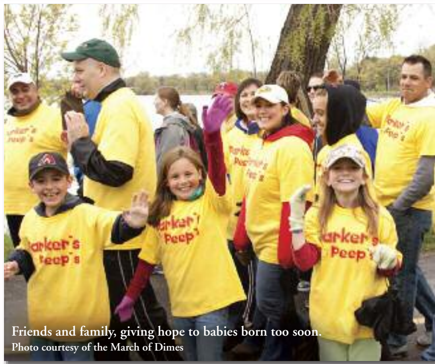
Friends and family, giving hope to babies born too soon.