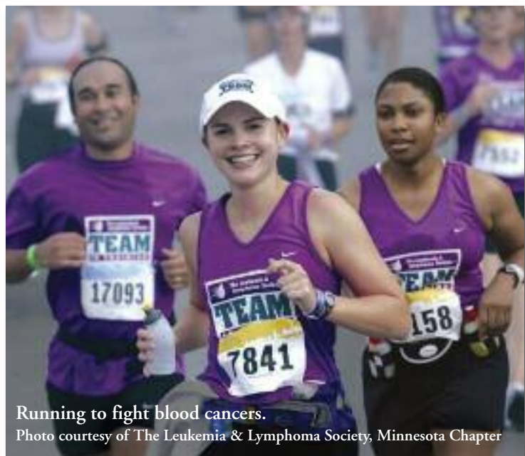
Running to fight blood cancers.